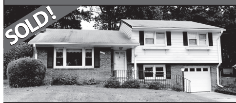
5323 Ravensworth Rd 3 bd's 1.5 ba's, Updated HVAC, Windows and Nice Kitchen! Great "Fixer-Upper!"