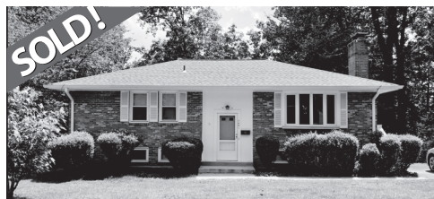
7601 Long Pine Drive 4 bd's 3 ba's, updated-roof, window, HVAC Orig baths and kitch-Sold "As-Is"