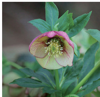
Helleborus x hybridus

(Picture from the MO Botanical Garden) http://www.missouribotanicalgarden.org/PlantFinder/PlantFinderDetails.aspx?kempercode=c990