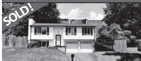
7300 Husky Lane 4 bd's 3 ba's, nicely updated with rare double garage in North Springfield!